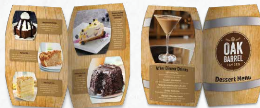
Beer Barrel Folded Menus