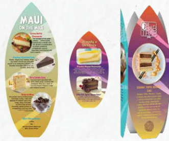
Surfboard Sluggler Menus & Cards