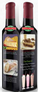
Die-Cut Table Tents